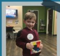
Grayson has read 67 books