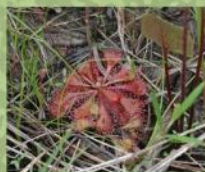
Drosera brevifolia (Dwarf Sundew)