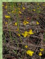
Utricularia subulata (Yellow Bladderwort)